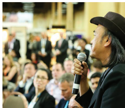
2016 Winner - Holojem